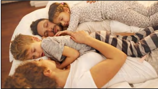
Image Reflection: Write down some strengths you observe in this image.