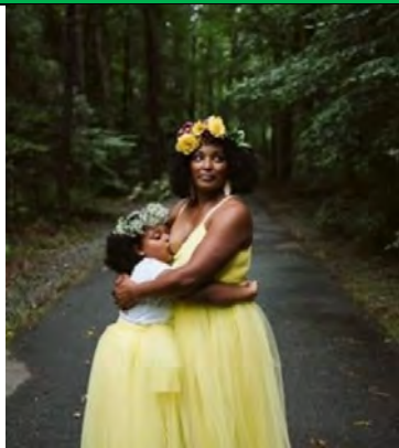
Image Reflection: Write down some strengths you observe in this image.