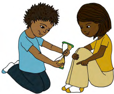
Set a Timer