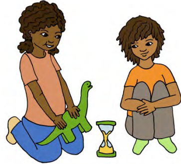
Waiting 1 minute