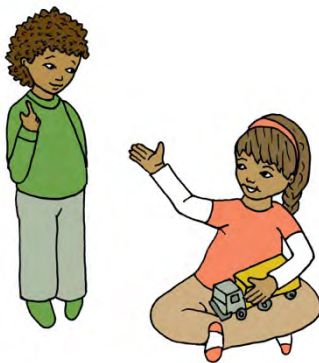
Let's Play Together