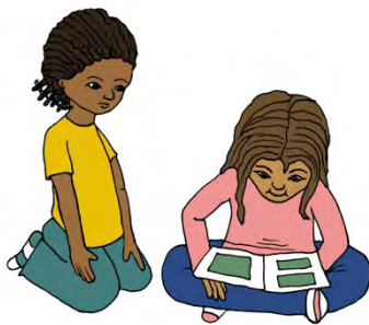
Wait Patiently for a Turn