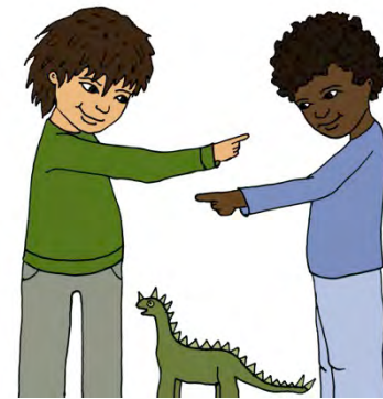
Eeny Meeny Miney Mo