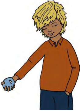
Squeeze a Ball