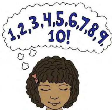
Count to 10