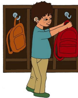
Put Items in Cubby