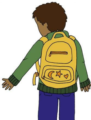
Put on Backpack