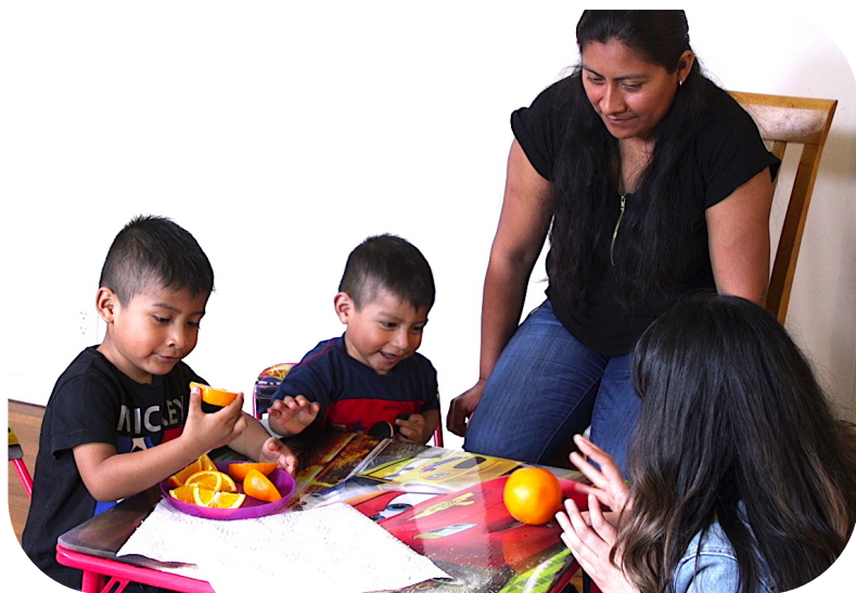
Home as a learning environment