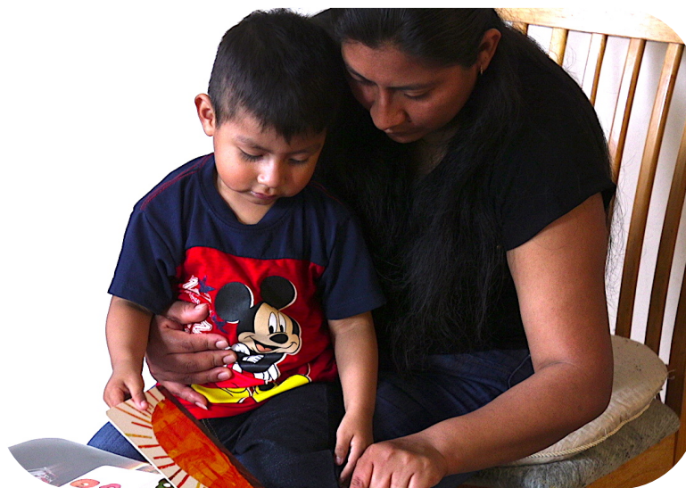
Learning experiences during play and routines