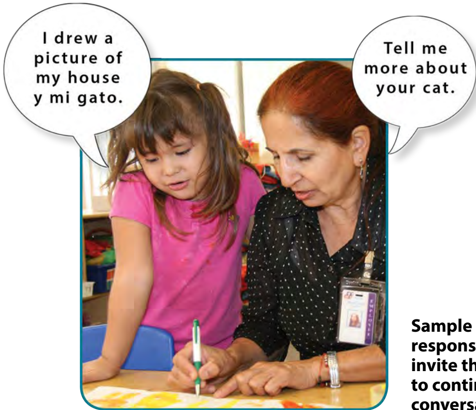
Sample adult responses that invite the child to continue the conversation