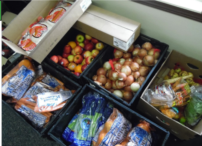
Polk County Food Share